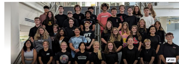
William Tennent Marching Band

WTMB Weekly Update September 4 to September 10